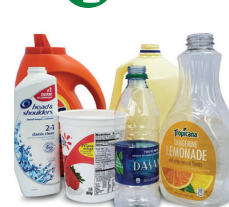
Kitchen, Laundry, Bath: Bottles and Containers ONLY #1, #2 & #5