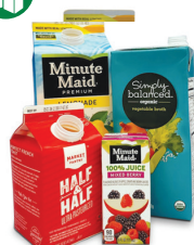
Food and Beverage Cartons