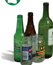
Bottles and Jars