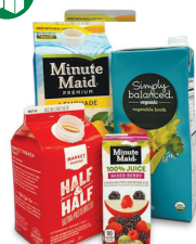
Food and Beverage Cartons