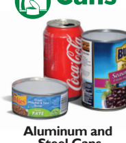
Aluminum and Steel Cans