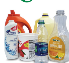
Kitchen, Laundry, Bath: Bottles and Containers ONLY #1, #2 & #5