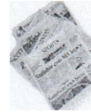
Newspapers and inserts