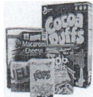
Paperboard (cereal boxes, paper towel rolls, etc.)