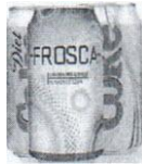
Aluminum cans, aluminum foil and pie tins