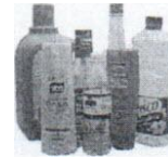
Plastic containers numbers 1-2-5

Food & Beverage cartons: Aseptic as well as refrigerated, milk, juice, soy milk, broth, soup, etc.