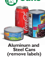
Aluminum and Steel Cans (remove labels)