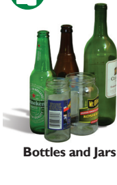
Bottles and Jars