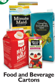
Food and Beverage Cartons