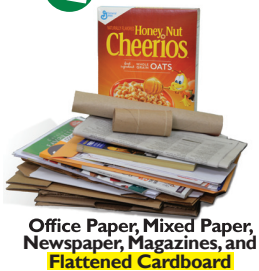
Office Paper, Mixed Paper, Newspaper, Magazines, and Flattened Cardboard