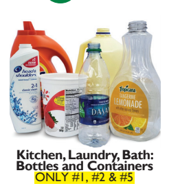
Kitchen, Laundry, Bath: Bottles and Containers ONLY #1, #2 & #5