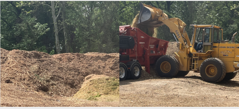
FREE wood mulch available now for Bergenfield residents! Monday-Friday 7:30 am-3:00 pm when the gate is open (closed on weekends & holidays)

Pickup site: Windsor Road, between New Bridge Road and Maiden Lane.