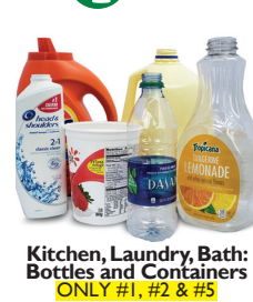
Kitchen, Laundry, Bath: Bottles and Containers ONLY #1, #2 & #5