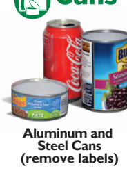
Aluminum and Steel Cans (remove labels)