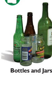
Bottles and Jars