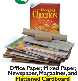
Office Paper, Mixed Paper, Newspaper, Magazines, and Flattened Cardboard