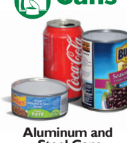
Aluminum and Steel Cans (remove labels)