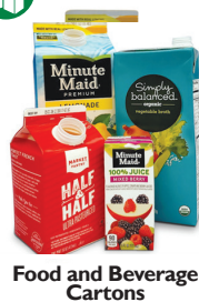
Food and Beverage Cartons