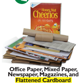
Office Paper, Mixed Paper, Newspaper, Magazines, and Flattened Cardboard