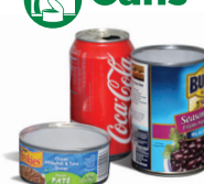
Aluminum and Steel Cans (remove labels)