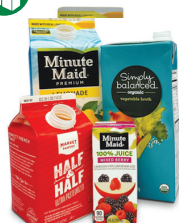
Food and Beverage Cartons