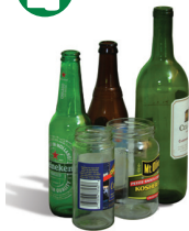
Bottles and Jars