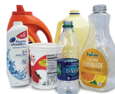
Kitchen, Laundry, Bath: Bottles and Containers ONLY #1, #2 & #5